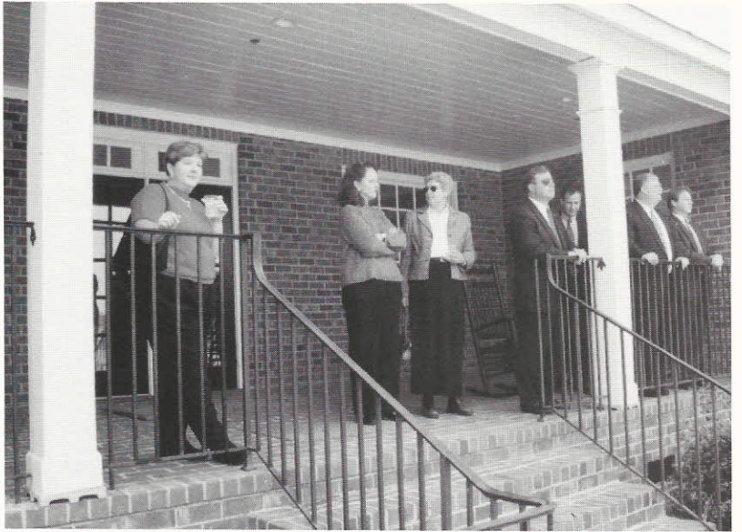
Following the reception in the Risher Administration Building, many of the visitors elected to watch the parade from the porch.