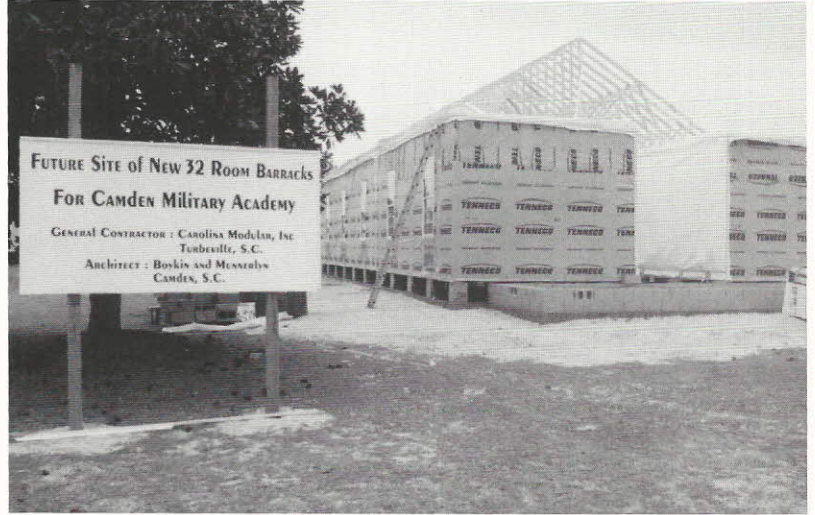
New Barracks: From a spot on the ground to an impressively large structure gradually taking shape, the new barracks through "cellular growth" will eventually become a comfortable building of 12,000 square feet.