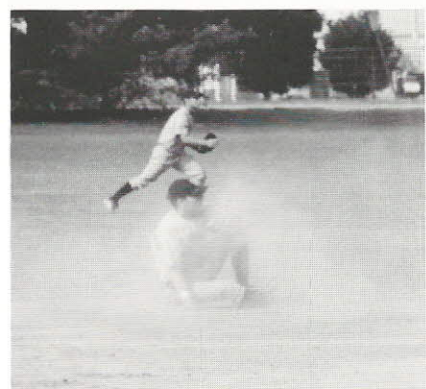
After making a spectacular diving backhand catch, senior Ren Stanley makes the throw to first base for the out.