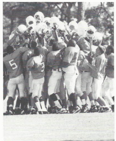
Victorious Spartans celebrate after a hard-fought contest.