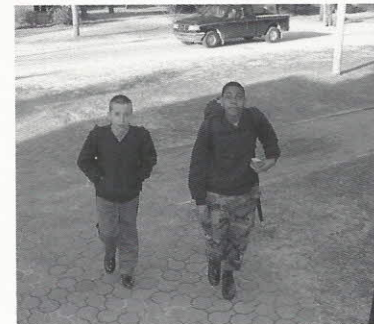
After breakfast, we return to the barracks, get our books, and walk to class.