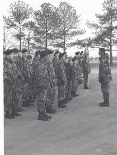
Finally, we are ready to leave the barracks. We form up and march out.