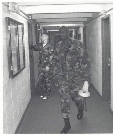
It starts at 6:00 A. M. with the Tac or the CO or both making noise to roust us out, sometimes with a siren.