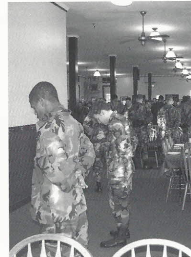
Before breakfast come the Pledge of Allegiance and a prayer.