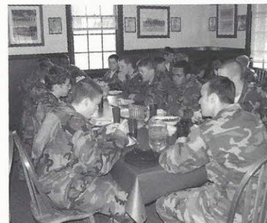
At breakfast we are always hungry. We have been up and working for an hour and a half.