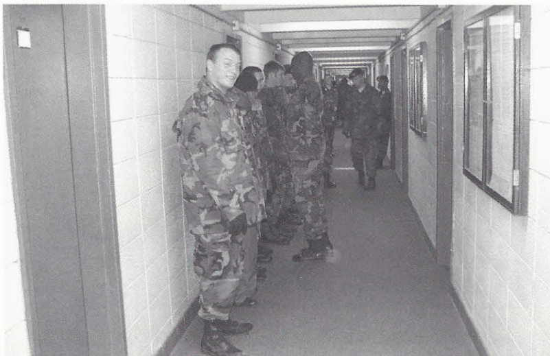
After room inspection comes uniform inspection, when the Tac and Co look us over from head to foot.