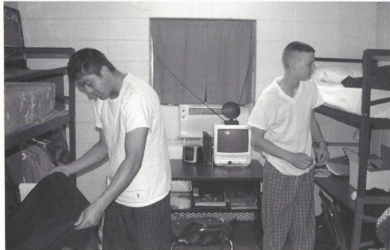
Next, we have to clean our rooms because there will be an inspection before we go to breakfast.