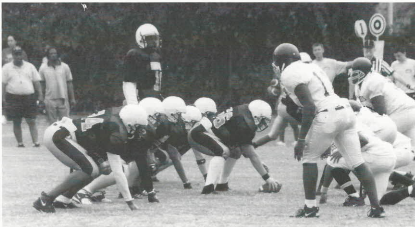
The Spartan offensive line prepares for the snap.