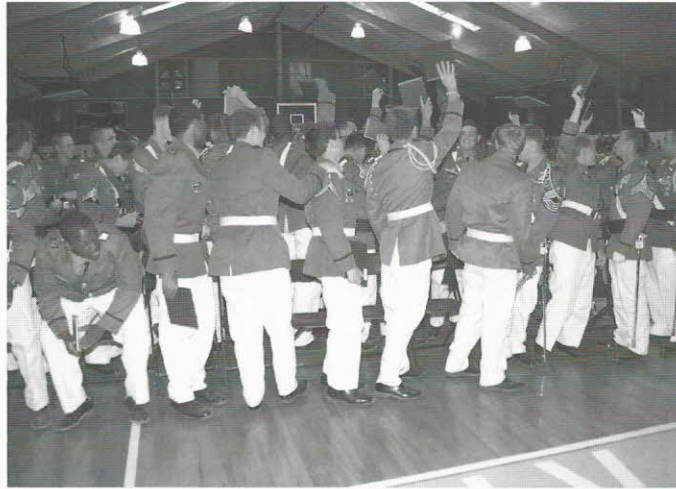
Members of the Class of 2004 celebrate after receiving their diplomas.