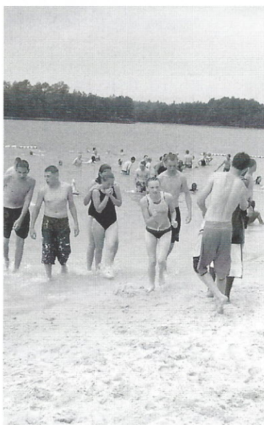
Down time also provided the opportunity for swimming and participating in field events.