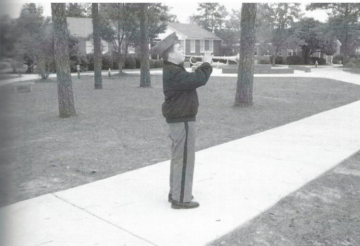
er: Craig Saxton