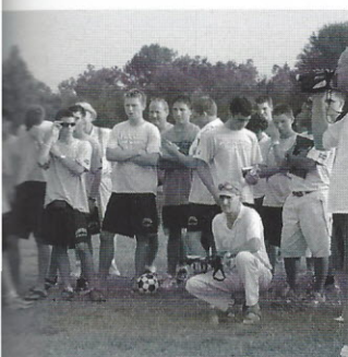
The CMA Cross-country Team checks things out before the race.