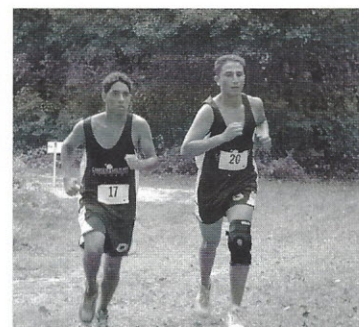
I am going to pass you now.