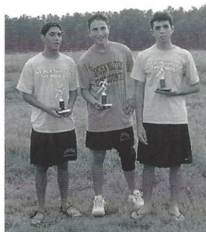
Three winners at the Wilson Hall Tournament