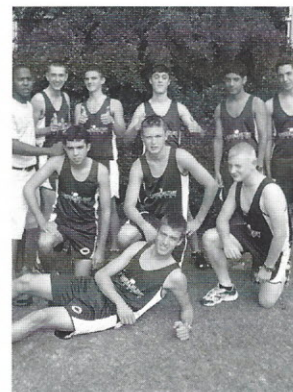
CMA pregame, before they run through the woods