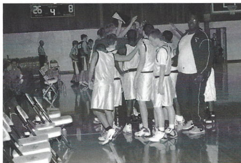
The Spartans get ready to go back into action after a time out.