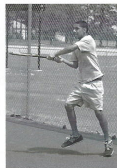
Hample generates tremendous topspin on his backhand.