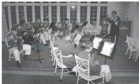
Excilibur Banquet: At the annual dinner in March for CMA's key supporters, the CMA Band played on and on to a very appreciative audience.