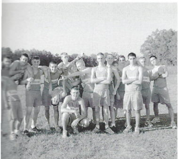
Spartan runners enjoy playing around before the meet.