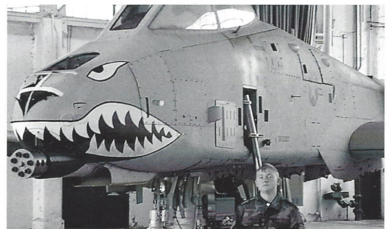
Cadet AM Peterson stands by an A-10, a close ground support fighter nicknamed "The Warthog." It is a lethal tank killer, and its titanium cockpit provides maximm protection for the pilot.