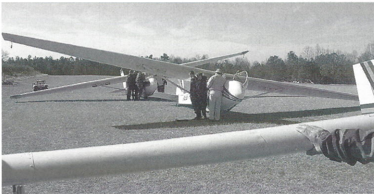
The Cadets get their gliders ready for takeoff into the wide open sky.