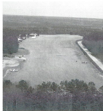
On a final approach into Bermuda High where the cadets go glider flying.