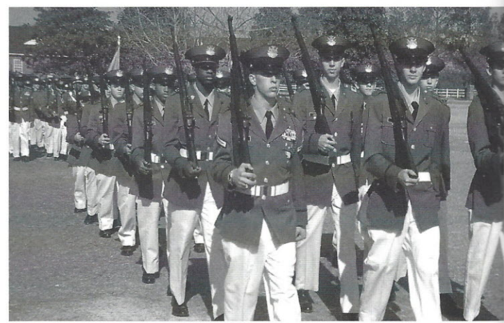
Right Shoulder Arms; for the pass and review.