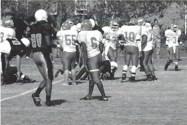
And that's another Camden Military first down.