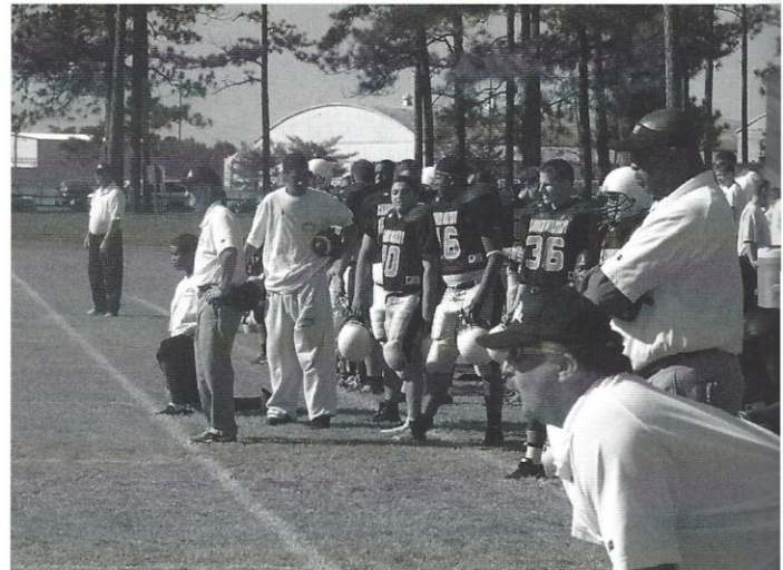
CMA coaches watch the action on the field.