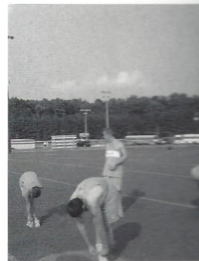
"What are you doing?" - Ried