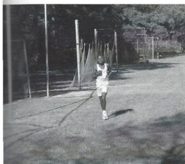
O Rodgers finishes strong.