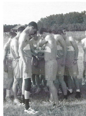
The team prays and says "1 heartbeat."