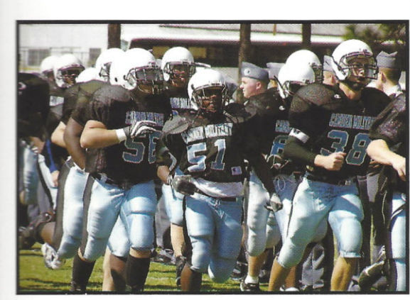
Above: The team makes an entrance through the assembly of cadets.