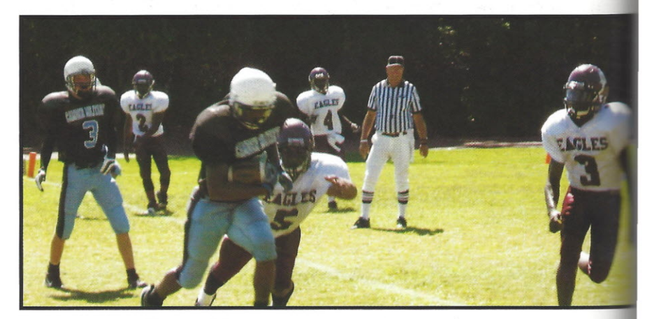
Above: Richards runs the ball back for the play.