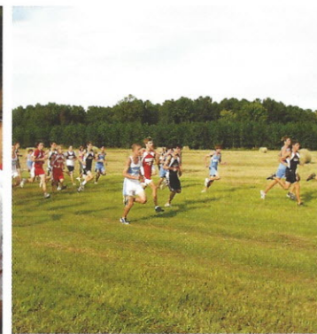
And They're off...