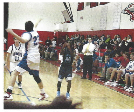
Spartan fires an arching jumper from the side of the circle.