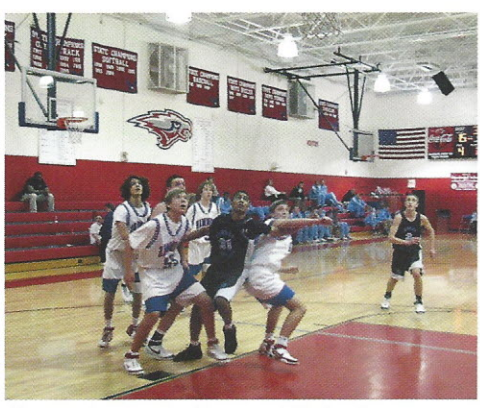
Spartans box out the Hammond Skyhawks.