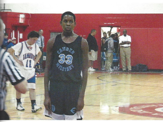
he prepares to shoot a free throw.