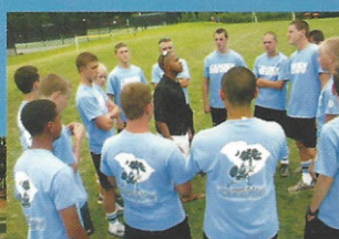
The Spartans pregame.