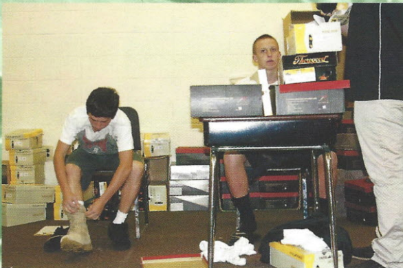
New Boys try on ACU boots and low quarter shoes in the gym.