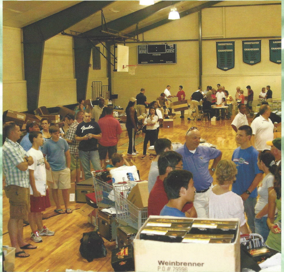
Families crowd into the White Field House to purchase supplies from the quartermaster.