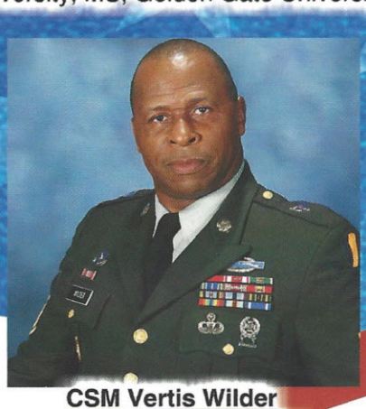
US Army(Ret.); Tactical Officer: Delta Company; Instructor: JROTC 1