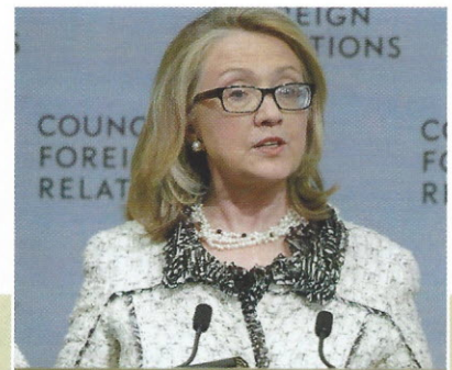
COUNCIL on FOREIGN RELATIONS