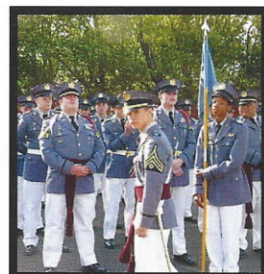
Residents of Kershaw County walk down the field between the rows of cadets, signaling the start of the Special Olympics.