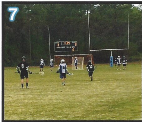
7. The whole game halts to await the referee's decision.