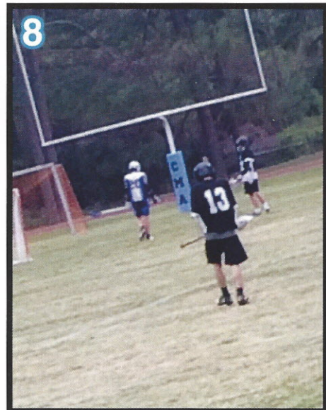
8. CMA's offense waits for the defense to bring the ball back.