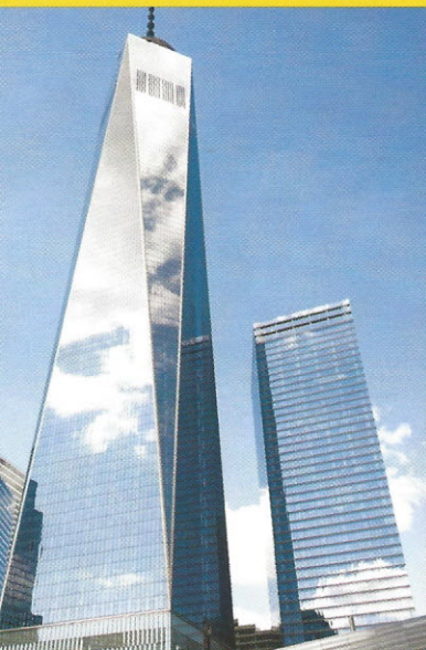
WORLD TRADE CENTER 2