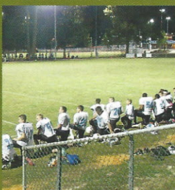
The Spartans take a knee as an injured player is escorted off the field.