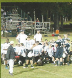
Both Junior High teams kneel on the field before the game begins.