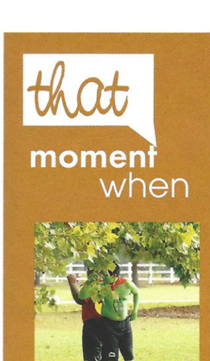
School spirit is an important part of everyday life at CMA