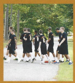
Bravo Company finished with their event, heads to their next activity