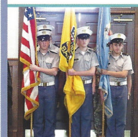
Color Guard CMA's Color Guard, prepares to post the colors during the singing of "America the Beautiful"