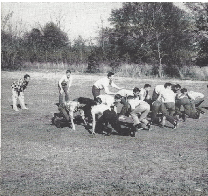
The All Stars of C and D Company Battling it Out