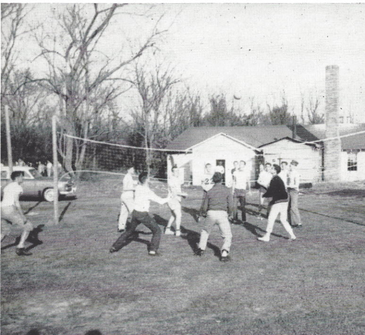
Batting it Around on the Volleyball Court