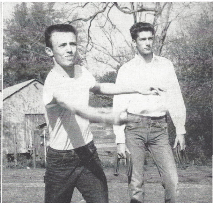
That One Still has the Horse on it