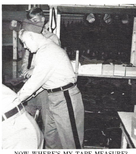
NOW WHERE'S MY TAPE MEASURE?