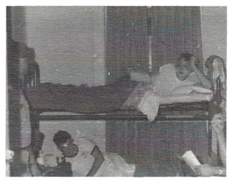
THE CLEARISIL KIDS