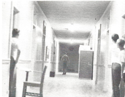
GO TO THE LATRINE, SIR?