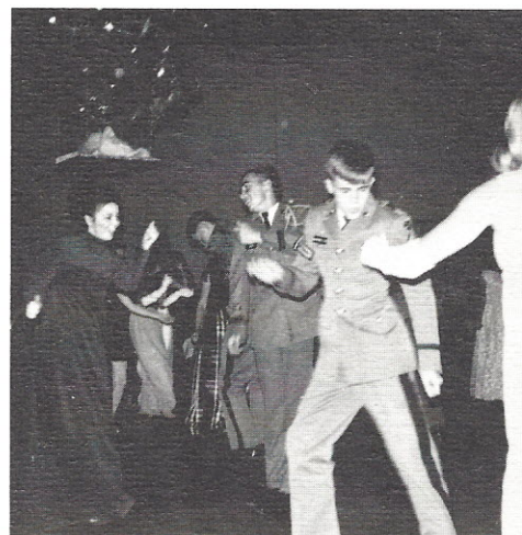
AND THEY CALL IT DANCING!