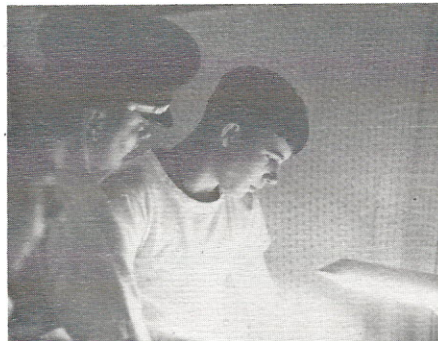
GETTIN' IN A LITTLE PULL