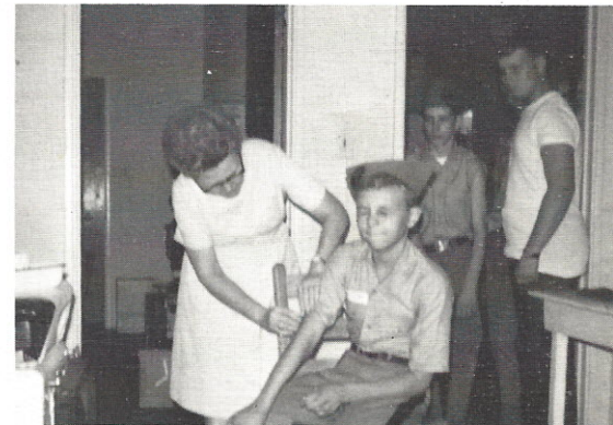
Of course, some sections of our city aren't so groovy — the shot section, for example . . .