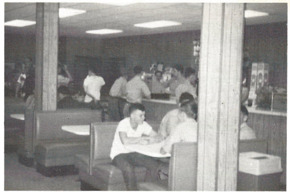
Cadets lounge in the school's beautiful new canteen.

An intellectual climate in which any one of the three basic elements of home, school and church is absent, is as lifeless as would be an actual physical climate lacking any one of the vital necessities of sustenance, sunlight or air. It is Carlisle's purpose that cadets be exposed to just those conditions which develop them in mind, body and spirit. A city owes its citizens no less.