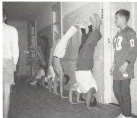
Up against the wall!