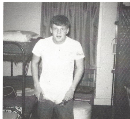
Smile — you're on candid camera!