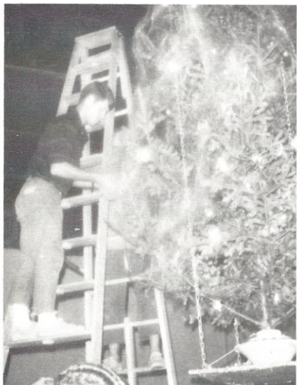
Is that your banana tree, Monkey?