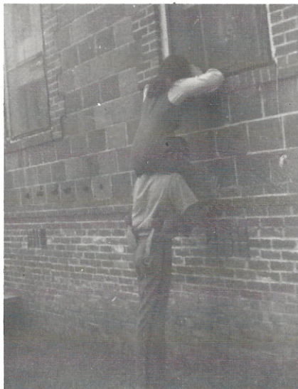
"You've got the way to make me heavy"