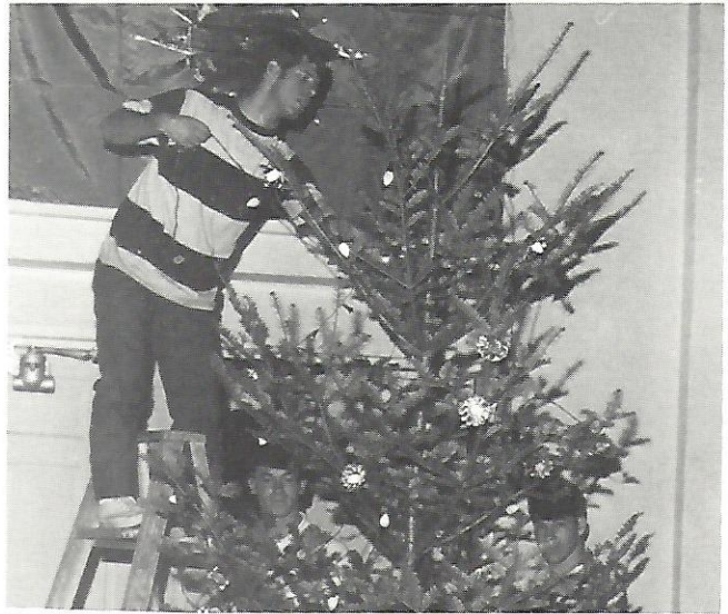
Can't get this darn banana straight!