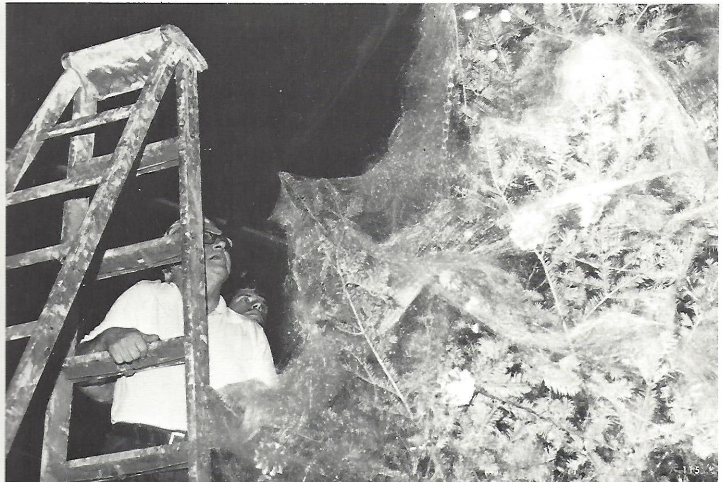
Looks like you've got a monkey on your back, Colonel.