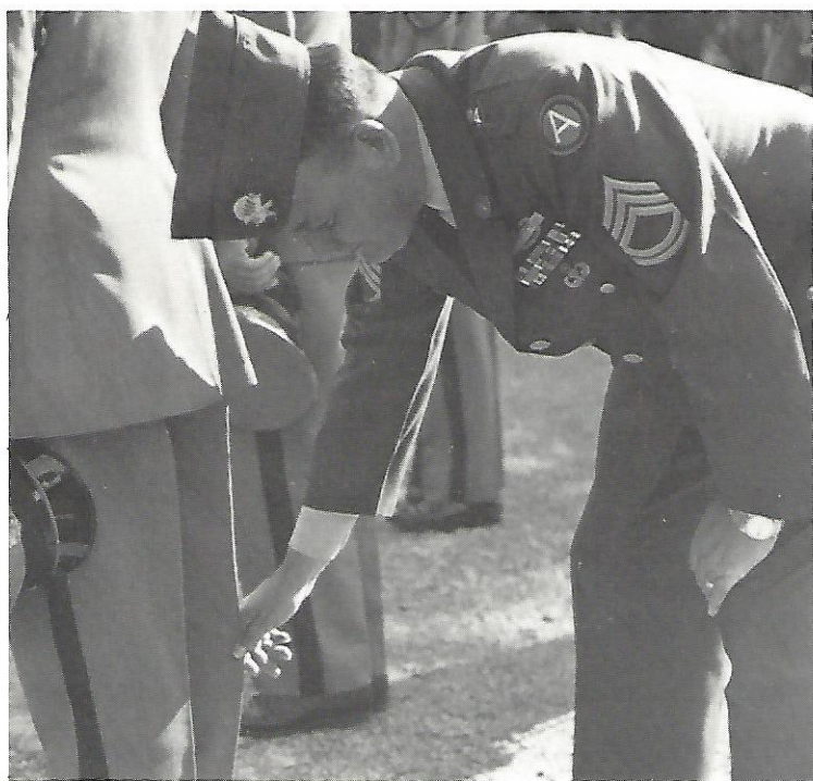
Picky, picky, picky!