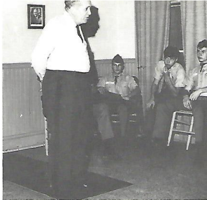
Friends, Romans . . .