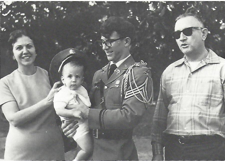
GETTING READY FOR THE CLASS OF '88