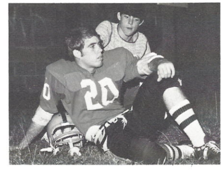
Who hit you!