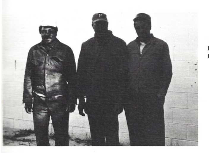
Can teen\ Staff