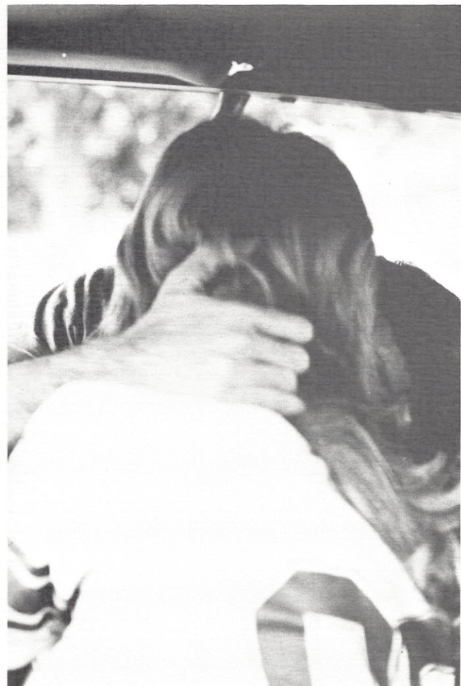
“Er, I’d like your opinion . . .”