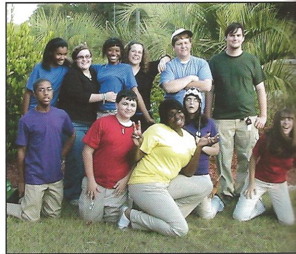
The cast of the play, "All I Need To Know, I Learned In Kindergarten," gathers for a group picture.