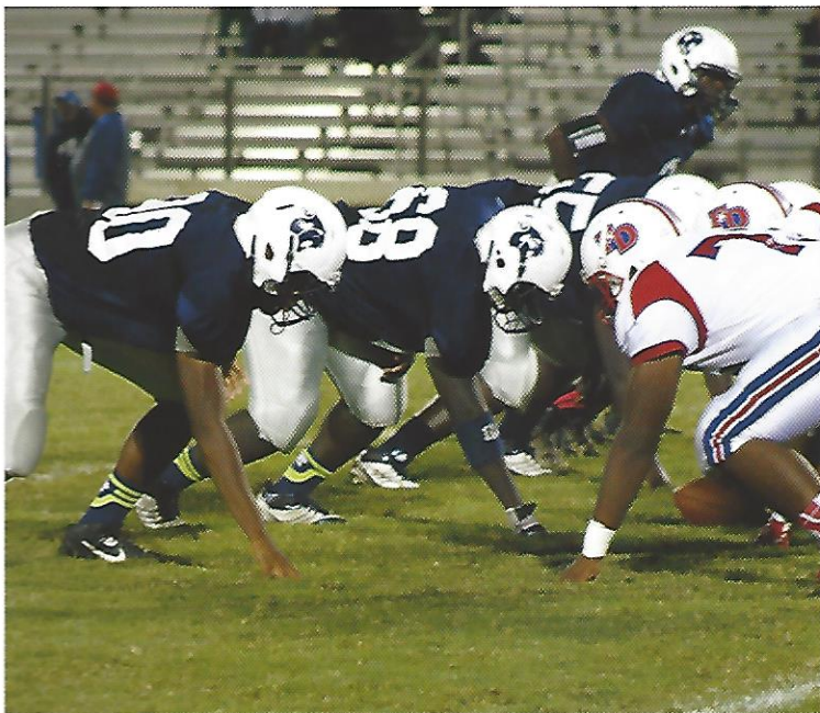
In a defensive lineup, the Cougars have are ready to change the game. The line awaits the snap of the ball from the Fort Dorchester High School center to begin the play.

"The greatest game you can win is from within." A popular football phrase came to fruition with the JV team this year. With a record of 2 wins and 6 losses, number of wins was not how the team measured its success. In fact, when speaking with several players, winning was just an added bonus to the personal victories. For many individuals, they improved their work ethic, attitude, and became more successful as people and players. Due to the improvements in playing abilities, several players switched back and forth between the junior varsity and varsity teams. This year's team lived up the phrase, "one team, one dream," by being a team that was a very closely knit group and played very well together.