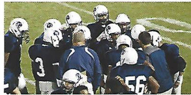
One of the most important places in a football field is the sidelines. Players reconvene at the sidelines to get instructions from their coaches.