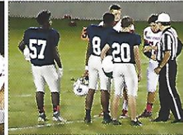
JV captains meet in the middle of the field to shake hands with the opposing team. Throughout the season, good sportsmanship was very important to the JV players and coaches.