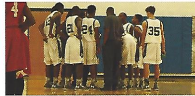
The team comes together for a brief pep talk from the coach to make sure they know what is expected of them when they go back on the court.