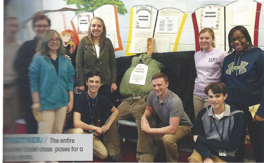
TEACHER CADET// The entire Teacher Cadet class poses for a group photo.

"A GOOD TEACHER CAN INSPIRE HOPE, IGNITE THE IMAGINATION AND INSTILL A LOVE OF LEARNING."