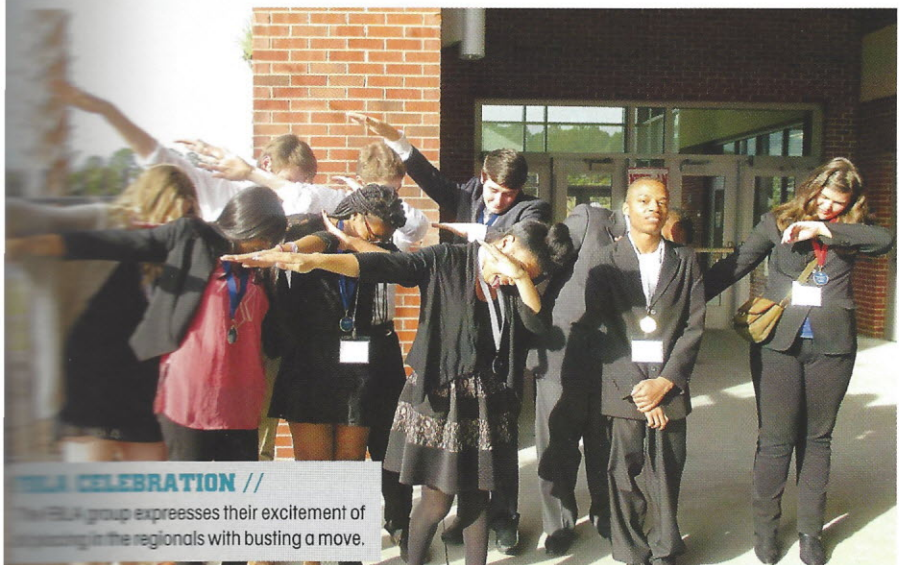
FBLA CELEBRATION // The FBLA group expresses their excitement of participating in the regionals with busting a move.

Community service, school functions, competitions: these are just a few of the activities that the Future Business Leaders of America club participates in during the school year. FBLA is designed to help expose students to careers in business, focusing on leadership development, educational programs, academic competitions and more to help students succeed in a business career. Attending the Fall Leadership Conference, hosted in Charleston, SC, is just one example of what FBLA does. The students associated with FBLA have the opportunity to participate in regional competitions and can place and move up to the state and even national division where they would be rewarded for their skills displayed among many other students from other schools.