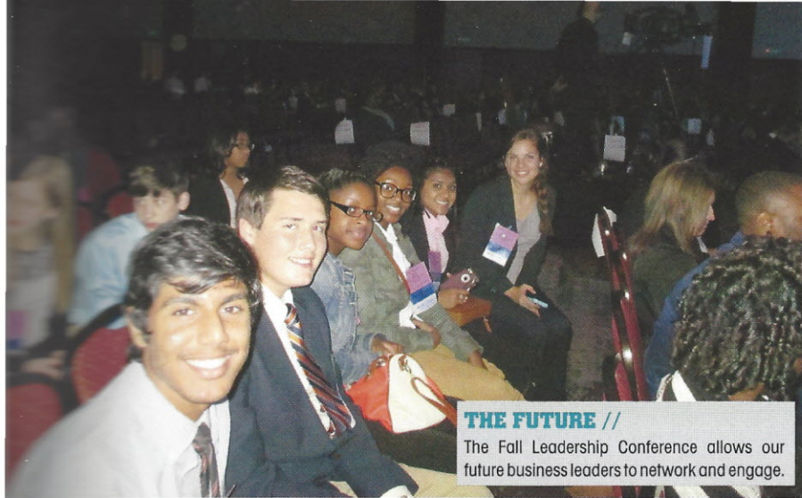
THE FUTURE // The Fall Leadership Conference allows our future business leaders to network and engage.

Community service, school functions, competitions: these are just a few of the activities that the Future Business Leaders of America club participates in during the school year. FBLA is designed to help expose students to careers in business, focusing on leadership development, educational programs, academic competitions and more to help students succeed in a business career. Attending the Fall Leadership Conference, hosted in Charleston, SC, is just one example of what FBLA does. The students associated with FBLA have the opportunity to participate in regional competitions and can place and move up to the state and even national division where they would be rewarded for their skills displayed among many other students from other schools.