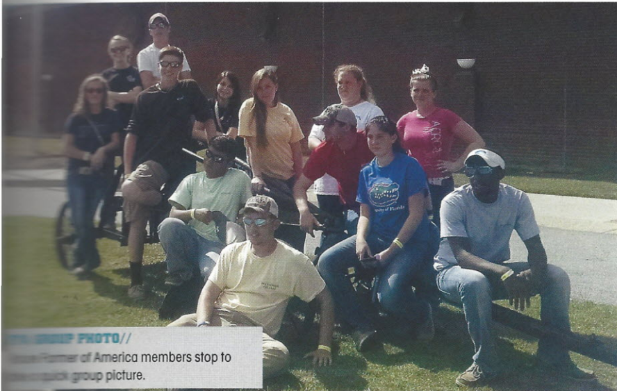
GROUP PHOTO // Future Farmers of America members stop to take a quick group picture.

Future Farmers of America is a youth organization within agricultural education that prepares students for premier leadership, personal growth, and career success. FFA was founded in 1928, making it 88 years old. While meeting monthly after school at TCTC, FFA members prepare for upcoming events. It is fairly easy to become a member of FFA: all you have to do is be enrolled in an agricultural class at TCTC. Being a member of this program gives you endless opportunities financially and spiritually. The National FFA Organization awarded $2.7 million in scholarships designed to fit the diversity of all FFA members, and most importantly, FFA teaches students how to work as a team and gain their own sense of personal growth.