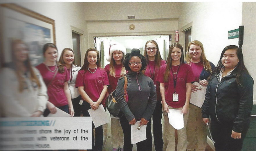
MEMBERS // Members share the joy of the holiday season with veterans at the Community House.

"From simple scrapes to failing hearts, HOSA is where the healing starts."