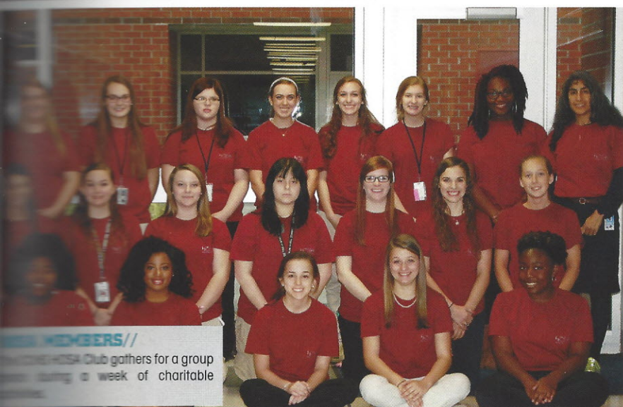
MEMBERS // The HOSA Club gathers for a group photo during a week of charitable activities.