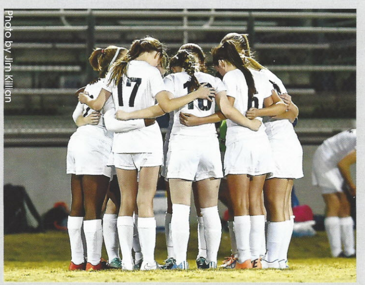
Before each game the team comes together as one body to strategize about the game and to remember to play safely.

"EVERY MOMENT YOU SPEND NOT PLAYING SOCCER, SOMEONE IS GETTING BETTER THAN YOU."